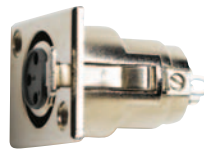
XLR (F) Panel Receptacle, 3 Contacts, Nickel-plated Zinc 5113A