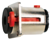
Panel Mount 1/4 Phone Jack, Locking 6877