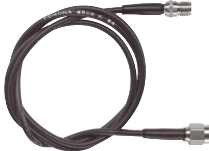
SMA (M) / SMZA(F) 50Ω Cable Assembly, 48in (1.2m) 4528