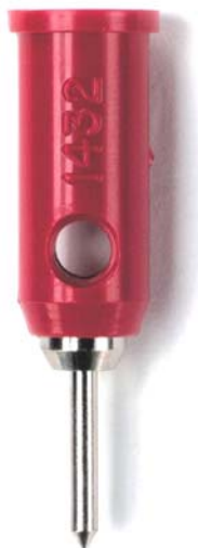
Model 1432 Banana Jack to Pin Tip Plug